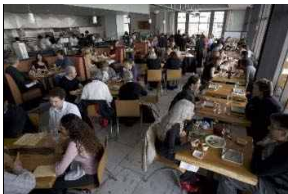
The Chronicle 2005

The Slanted Door is the top grossing restaurant in San Francisco